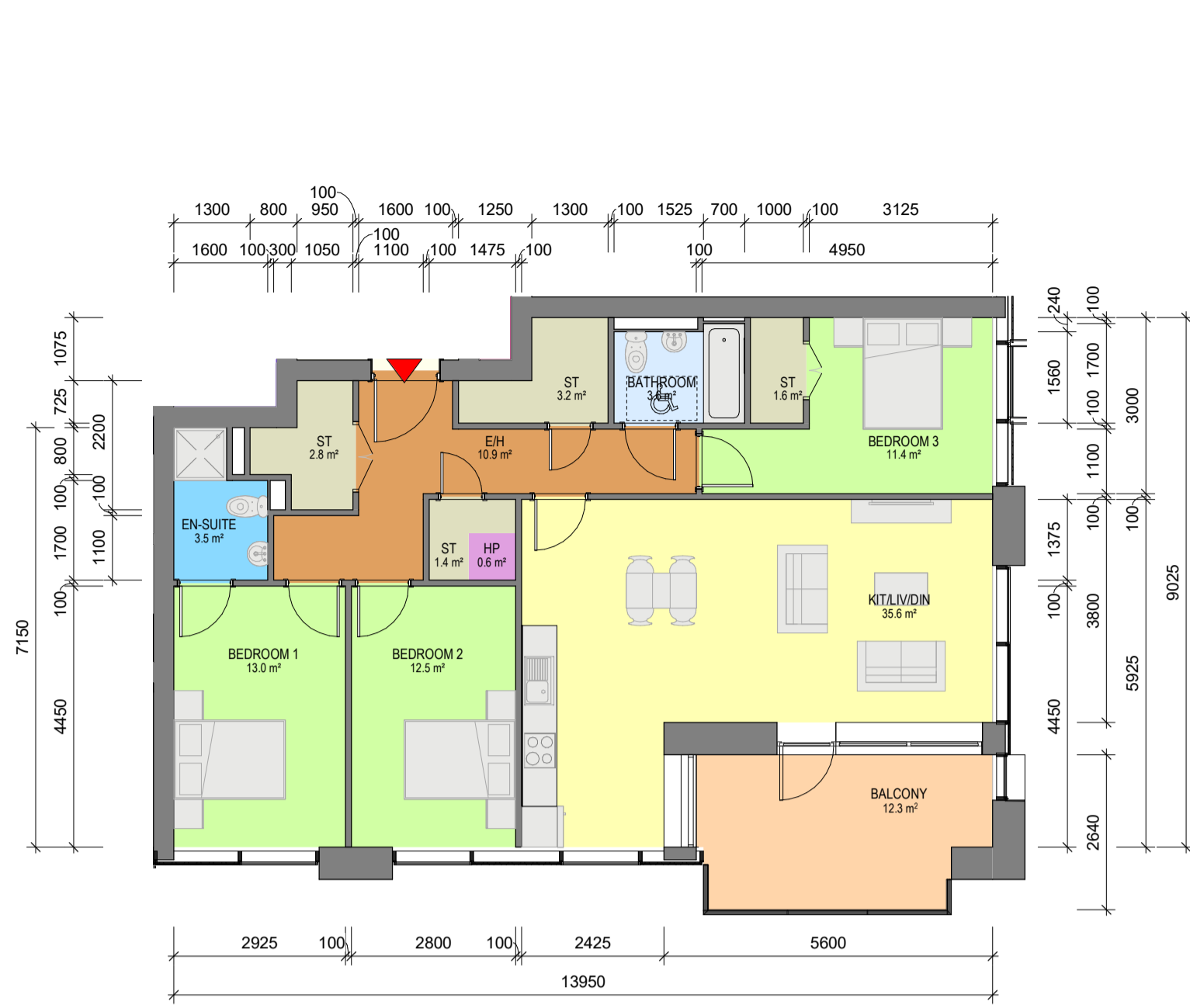
1 Apartment Type 3A