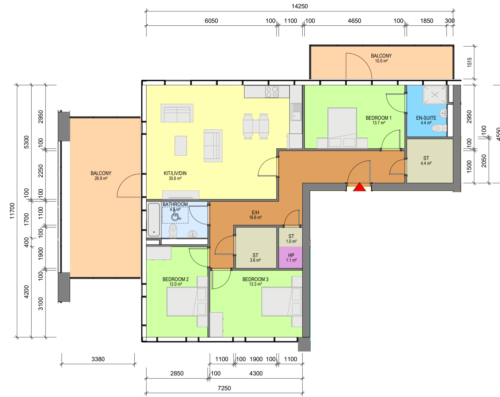
2 Apartment Type 3B