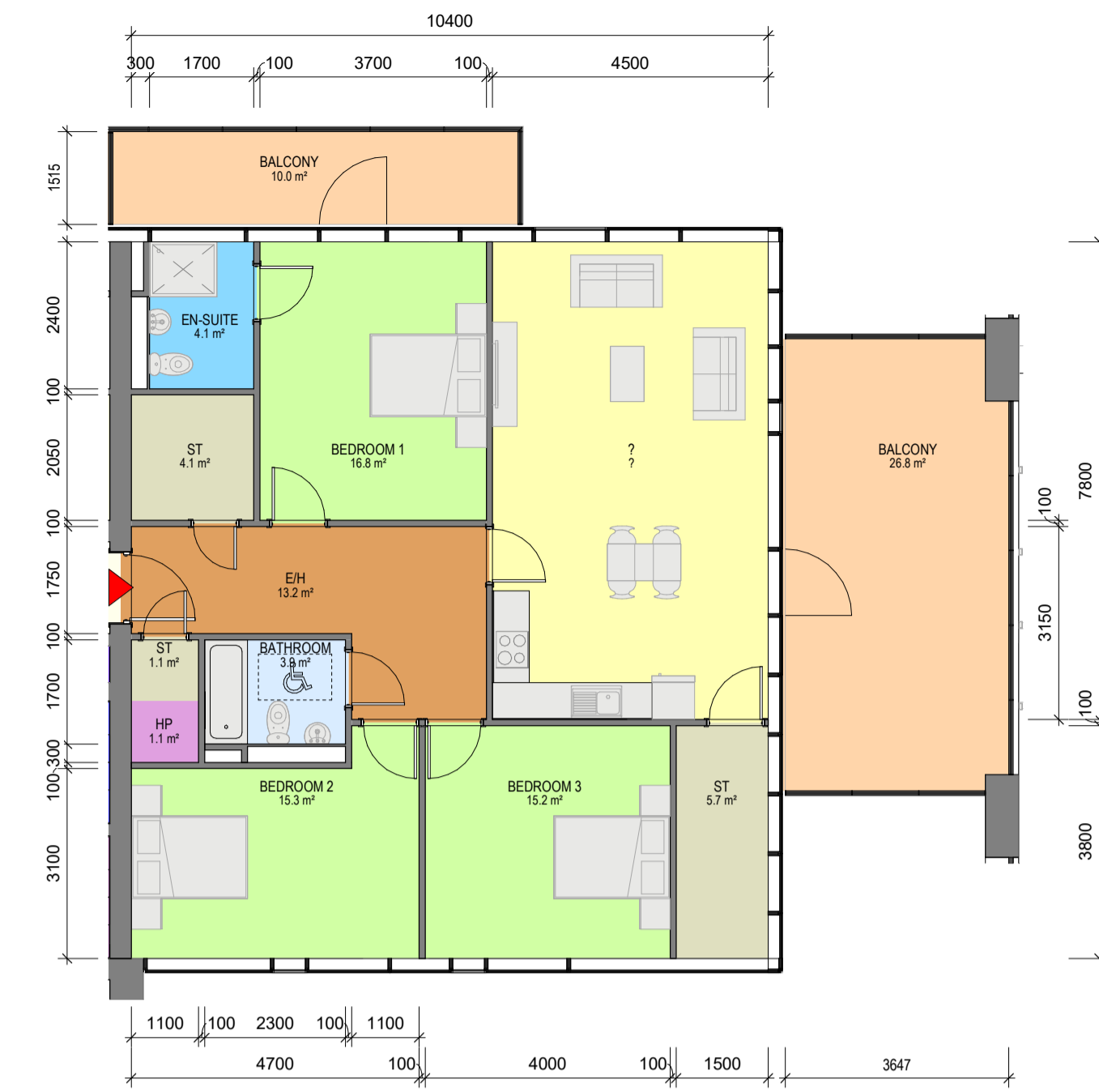
3 Apartment Type 3C