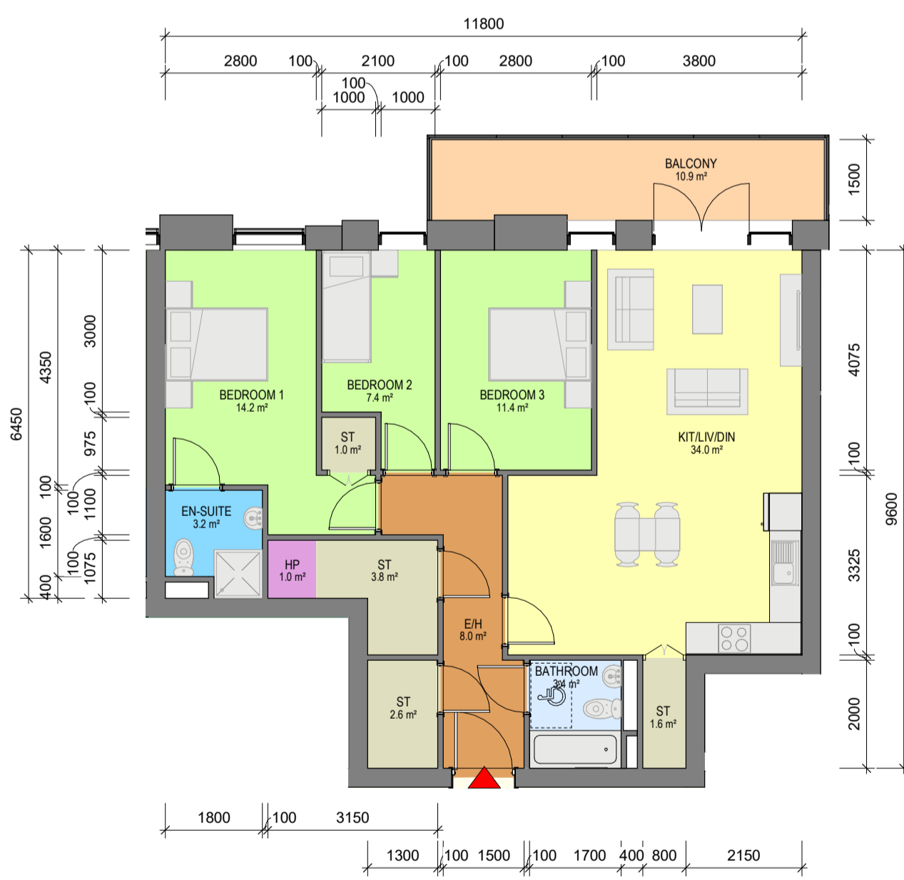
4 Apartment Type 3D