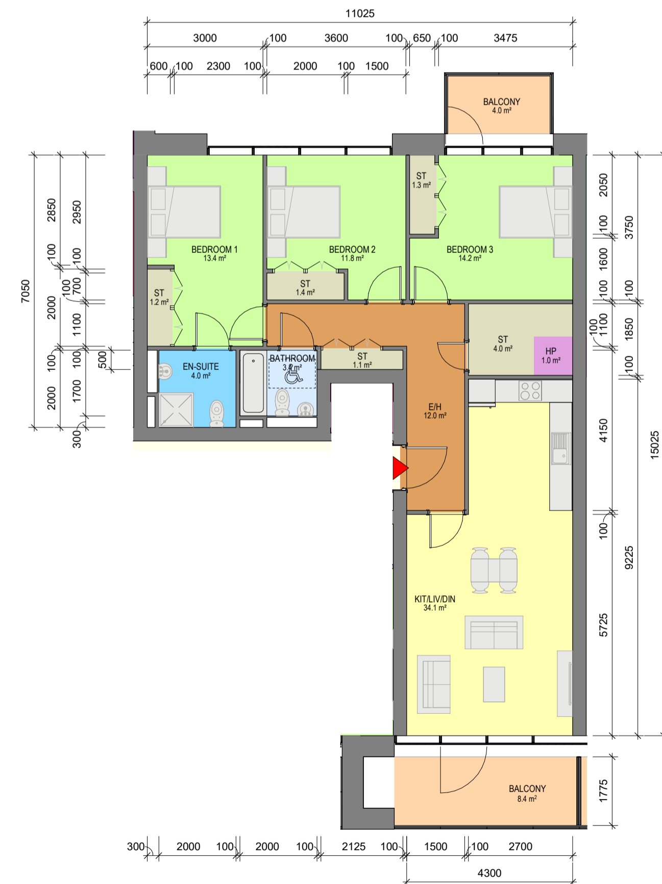
6 Apartment Type 3F